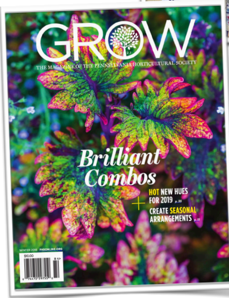
PHS Grow Magazine Winter 2018 Issue Meet Your Match - article contributor