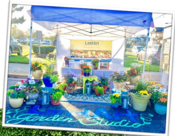
Ocean City, NJ Annual Fall Block Party Participant October 2017