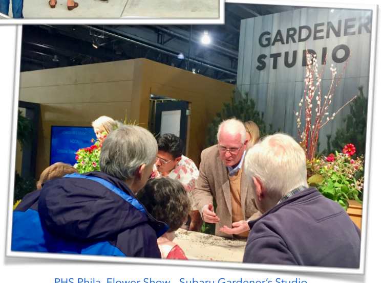
PHS Phila. Flower Show - Subaru Gardener's Studio Container Challenge - Participant March 2018