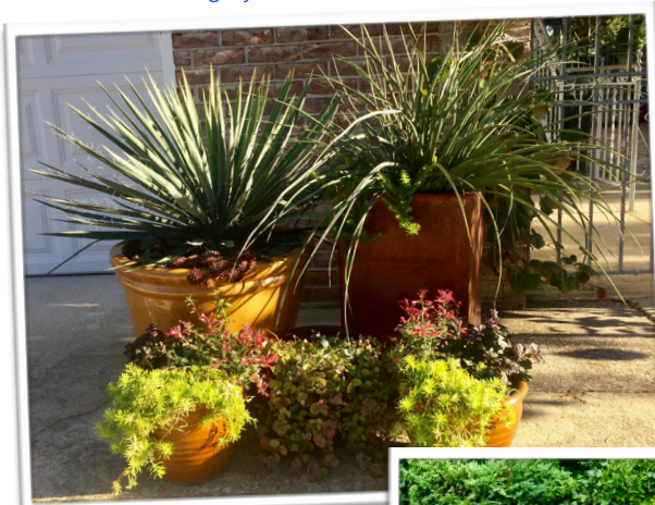
PHS Gardening & Greening Contest 2017 Container Category - Blue Ribbon Winner